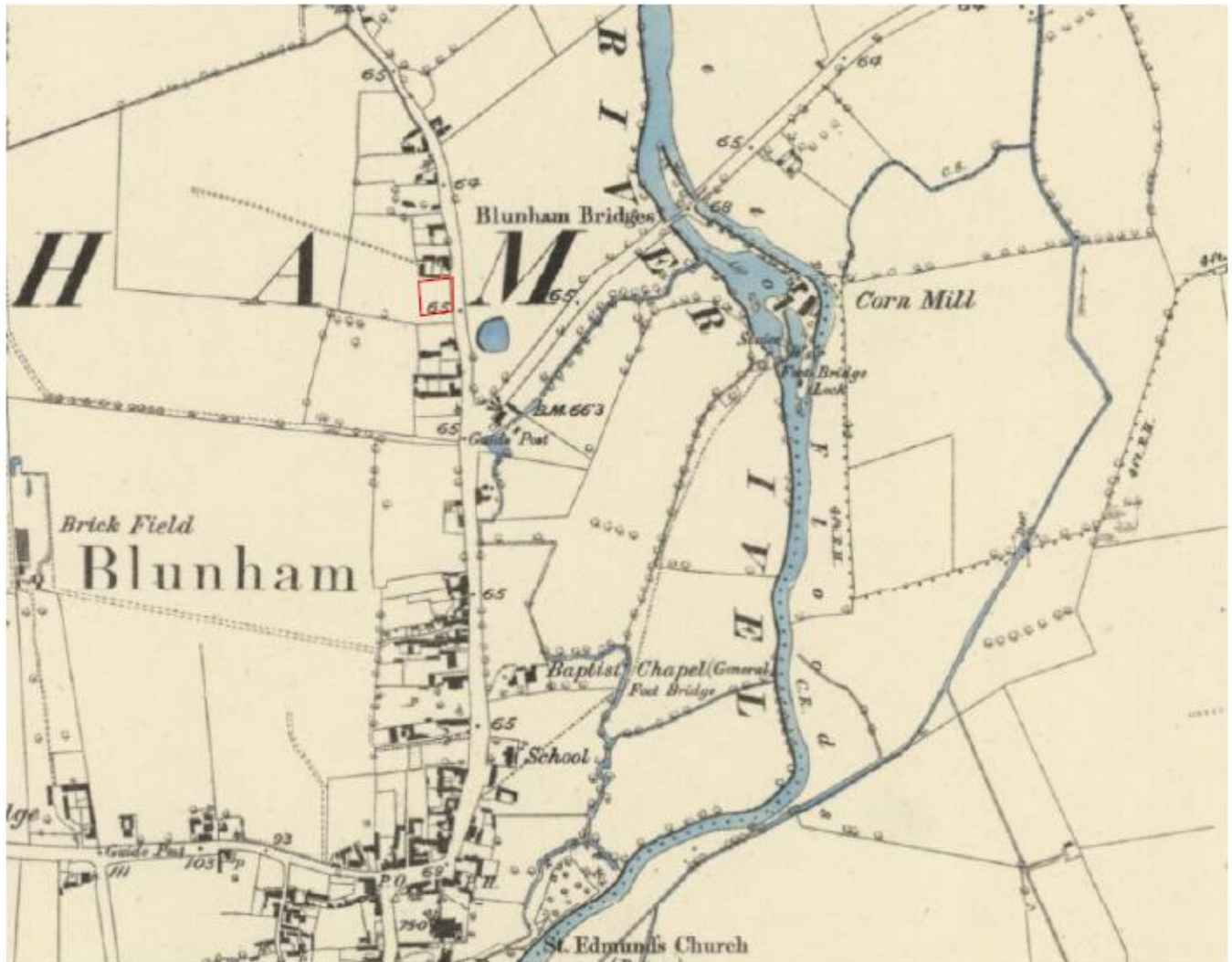
Maltings Farm, Grange Road, Blunham & Locale, 1881